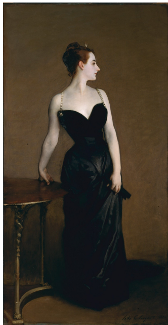
Madame X , 1884 oil on canvas Collection of Metropolitan Museum of Art

The 19 th century portrait painter John Singer Sargent found success creating flattering likenesses with virtuoso brushwork. His fluid, buttery brushstrokes and ability to render luxurious silks, satins, and velvets made him a favorite among the upper class and aristocracy. Despite this, his career was punctuated by criticism and controversy, including the scathing