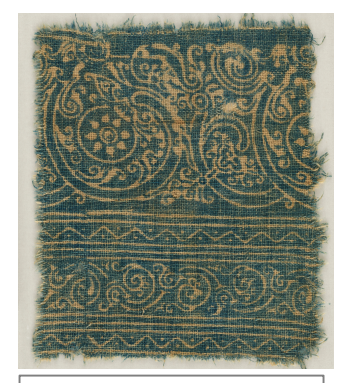
textile fragment Gujarat, India, circa 800 cotton, indigo dye The Textile Museum

Artists on the Indian subcontinent maintain some of the world's most ancient and illustrious textile traditions. Generations of cultivators, weavers, dyers, printers, and embroiderers have cleverly harnessed the region's rich natural resources to create a remarkable range of fine fabrics. Using examples from the collection of the George Washington University Museum, this talk will showcase Indian artists' achievements in textile production and