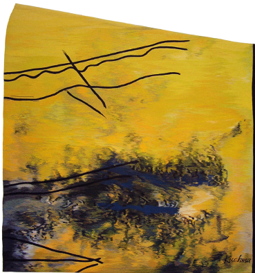
Jaroslava Lialia Kuchma (born 1944)

Artists who left the country, however, developed sought to develop a modern Ukrainian voice, and following the country's independence from Russia in 1991, artists again enjoyed a freedom of expression and launched a decade of exploring Western themes and styles.