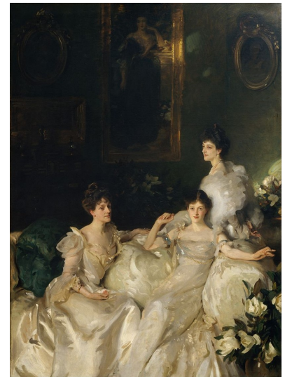
Wyndham Sisters , 1899 oil on canvas Collection of Metropolitan Museum of Art