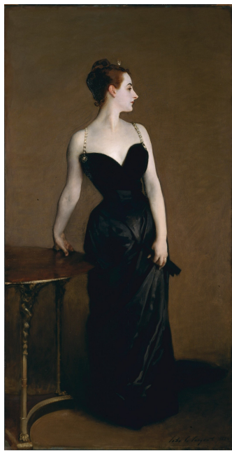
Madame X , 1884 oil on canvas Collection of Metropolitan Museum of Art

The 19 th century portrait painter John Singer Sargent found success creating flattering likenesses with virtuoso brushwork. His fluid, buttery brushstrokes and ability to render luxurious silks, satins, and velvets made him a favorite among the upper class and aristocracy. Despite this, his career was punctuated by criticism and controversy, including the scathing